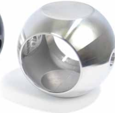
Stainless Steel Ball with HydroMax