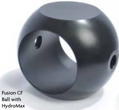
Fusion CF Ball with HydroMax

HydroMax technology is a patent pending ball geometry. This unique geometry is used in all Generation II valves and was designed specifically for the Stainless Steel and new Fusion CF Swing-Out valve balls. With this technology, the valve operating torque is LOWER and the gating flow is HIGHER. In comparison, the stainless steel ball in the Generation II valve has a 35% lower operating torque than the previous stainless steel ball. In addition, the valve will stay in it's position with no drift at up to 40% higher flows!