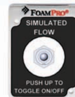
Optional Simulated Flow Switch