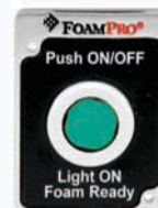
Optional Start/Stop Switch for in-cab control