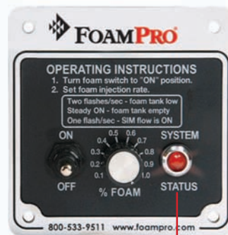
Ultra-Bright LED Light